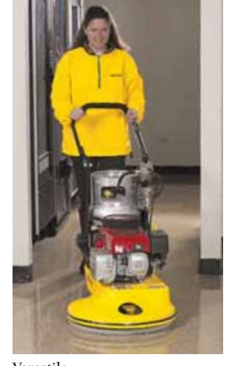
Versatile Industrial plants, large box retailers, schools, office buildings, and warehouses are just a few of the many applications for